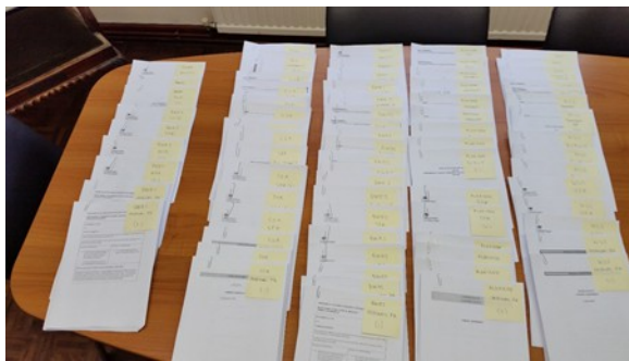
Bundles of papers prepared ready for signing

... but the Chairs of Governors of the five Founder Academies arrived at the meeting with the backing of their respective Governing Bodies. And they signed!